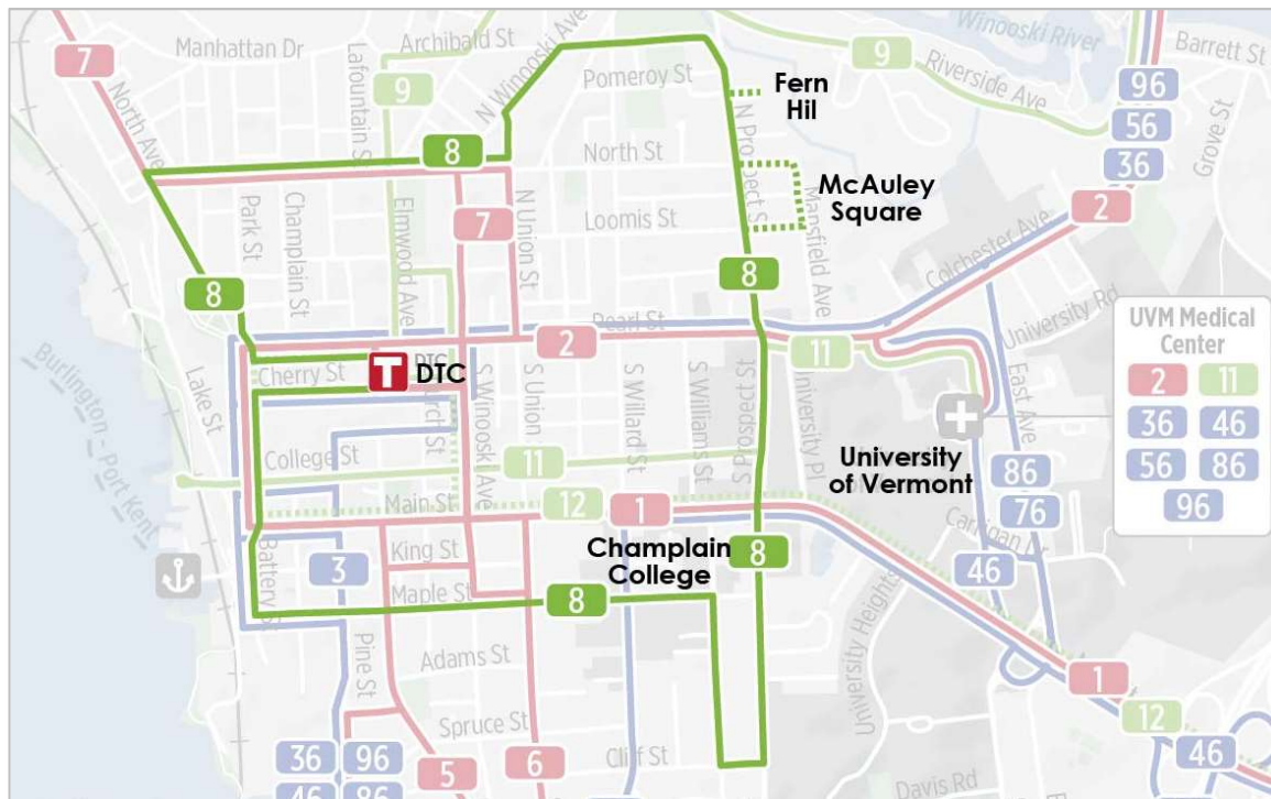
Figure 1: Route Map

On weekdays, Route 8 operates from 6:45 AM to 7:40 PM, every 30 minutes throughout the service day (see Table 1). On Saturdays, service operates from 6:45 AM to 6:40 PM, also every 30 minutes throughout the service day. No Sunday service is provided.