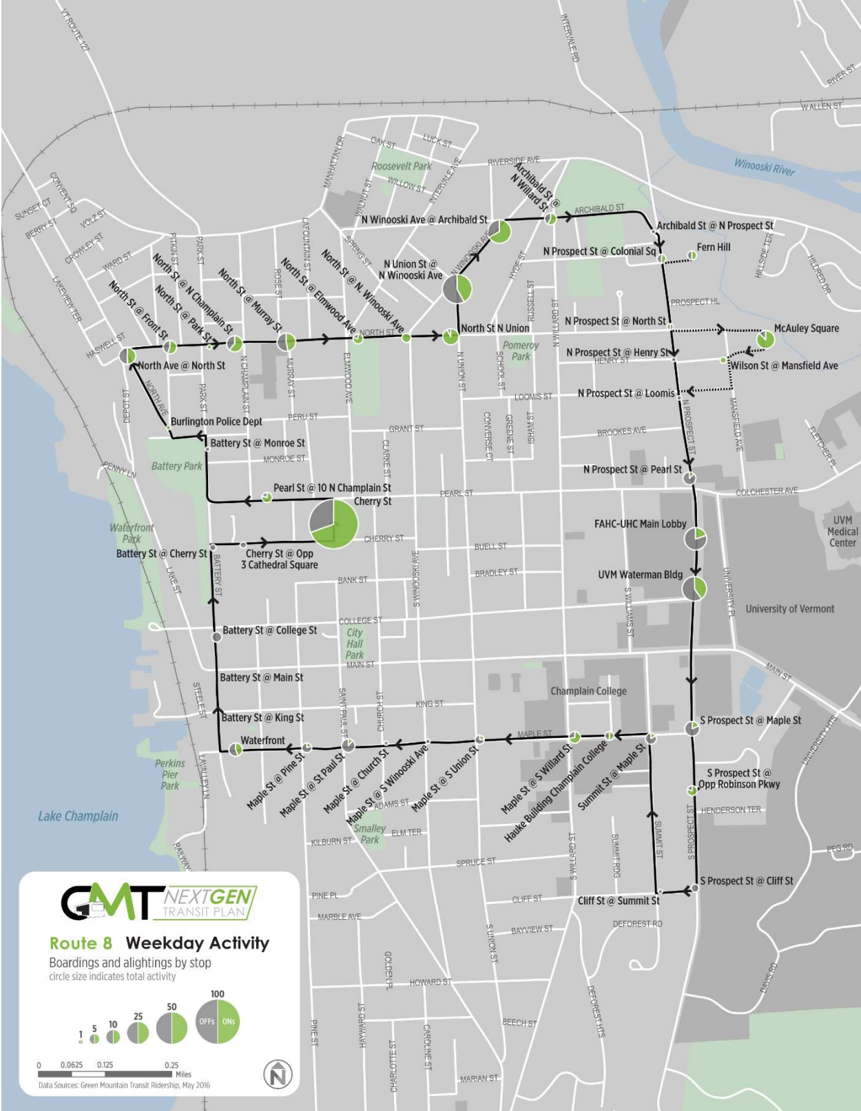
Figure 2: Weekday Inbound Ridership by Stop