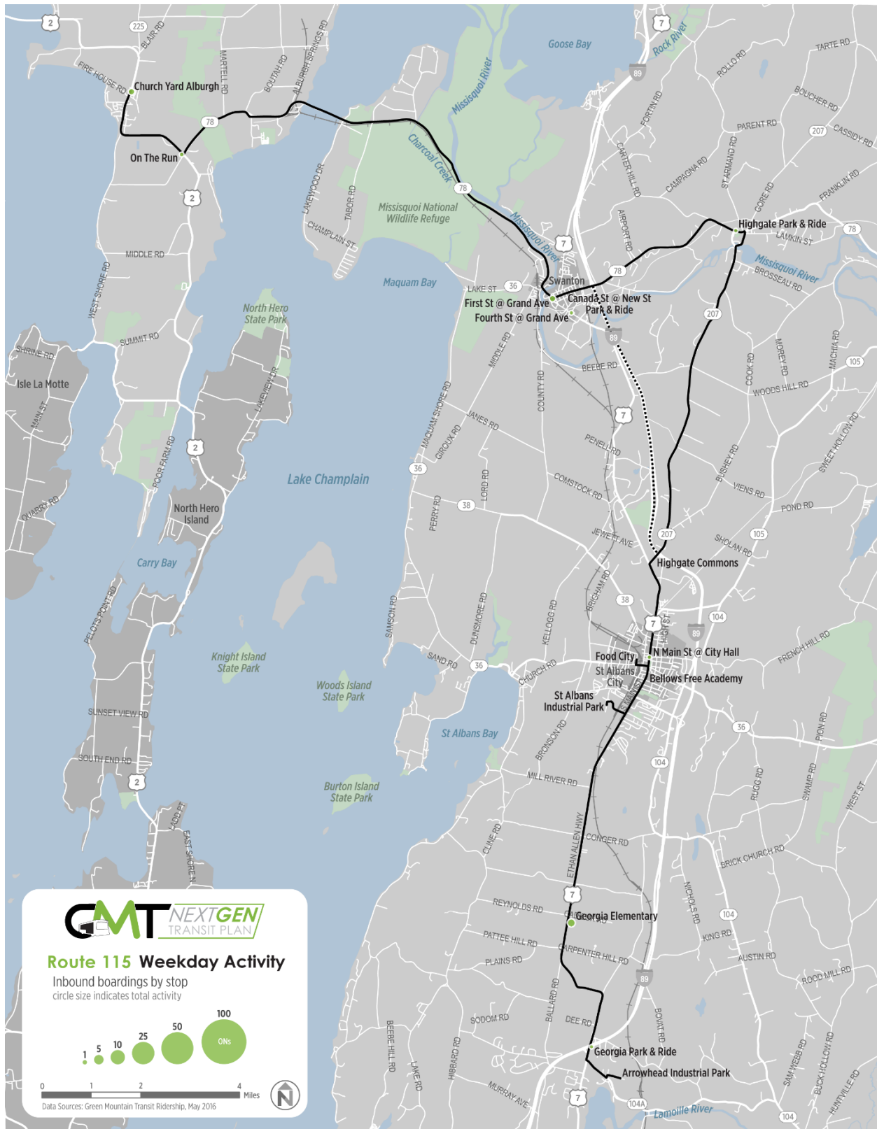
Figure 2: Weekday Inbound Ridership by Stop